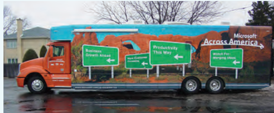
Video and audio systems we installed in seven traveling demo centers for Microsoft.

Cover and inside: photos from Microsoft Vista and Office 2007 introductions we staged in 59 cities. Inside flap: video billboard we installed in Times Square.